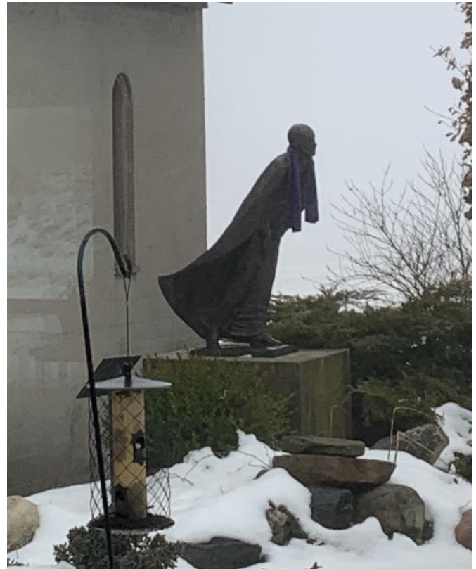
Statue of Ignatius Loyola (with a scarf on!)

Loyola House offers retreats on a variety of topics related to spirituality. Although the community is Jesuit, it is open to people of all faiths or no faith. The food is healthy and delicious, the accommodations very comfortable, and the cost is very reasonable in order to be accessible to many. I heartily recommend that you check out this wonderful place, which is just next door in Guelph. And, if you have not already, try dipping into some of Merton's writings. As Anne Lamott writes on the back of his published journals, "A lot of my spiritual seeking began with Thomas Merton. He is an incredible source of light and comfort and humour. You meet a great spirit in this book."