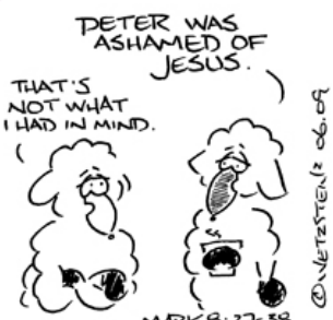
Agnus Day appears with the permission of www.agnusday.org